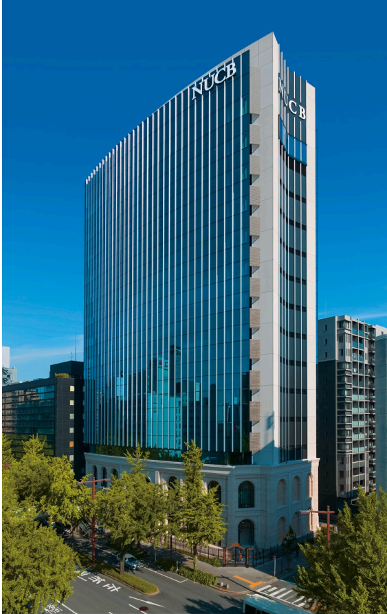
NUCB Business School